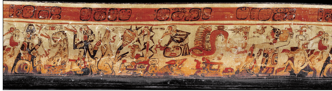
Figure 1. Roll-out photograph of Late Classic vessel scene; note bull's horn acacia in center (photograph by Justin Kerr, from Coe 1982:No. 12).

In a recent publication, Michael Coe (1982:36-37) illustrates and discusses a Late Classic round-sided polychrome bowl bearing a complex scene upon the exterior (Figure 1). Coe suggests that the vessel dates to Tepeu 1, that is, roughly within the seventh century AD. In form and style of painting, it is similar to a number of other published vessels of unknown provenance (Coe 1973:Nos. 37-39, 1982:No. 10; Robicsek 1978:Pls. 18, 137-140, Figs. 146-147). According to one recent study, these vessels may derive from a region between Tikal and the Belize border, possibly the site of Naranjo (Bishop et al. 1985:83). The exterior of the polychrome bowl contains a virtual menagerie of creatures known to inhabit the Maya lowlands. Along with three predominantly human figures, eleven distinct animal species are depicted. The human individuals are dressed, and appear to be specific Maya gods. One of the figures is clearly a woman, and according to Coe (1982:37), may represent the young moon goddess. The other two individuals are male with jaguar attributes along with black body paint and god markings. One of the black figures appears to be smoking while seated on a T528 Cauac sign. He wears jaguar spots on his hat and face and bears the eye "cruller" of the Jaguar God of the Underworld. 1