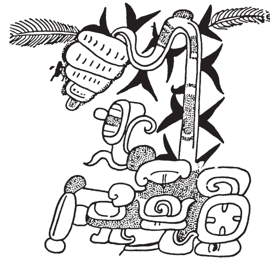
Figure 2. Detail of bull's horn acacia on top of zoomorphic head with maize nal sign on brow; note hornet nest at top of plant.

Because of the prominent V-shaped elements upon the slender, twisting trunk, Dr. Coe (1982:36) mentions that the Classic vessel plant resembles a "lobster claw" Heliconia . He also notes the curious fan-like elements near the top of the plant, which he identifies as Moan bird feathers. Rather than referring to a fantastic hybrid plant, however, the V-shaped and feather-like devices represent an actual thorny plant species of the genus Acacia . In the Maya region, there are at least four species of swollen thorn acacia, Acacia cornigera , Acacia sphaerocephala , Acacia hindsii , and Acacia collinsii (Janzen 1966:252). Swollen thorn acacia are known by many names throughout Mesoamerica. In English, they are commonly termed bull's horn acacia. In Spanish, they are frequently referred to as cuernos de toro , or cornizuelo . The references to bull horns derive from the sharply bifurcating pairs of thorns, which do bear a general resemblance to cattle horns (cf. Janzen 1967:Fig. 2). In the Classic polychrome scene, these thorns appear as V-shaped elements projecting from the trunk of the tree. Among the lowland Yucatec, swollen thorn acacia are known as subin (Barrera Vázquez et al. 1980:740), among the Tzotzil čohčoh (Laughlin 1975:123), and in Quiche, chocol or ixcanal (Edmonson 1965:28). Like the cited English and Spanish terms, the Yucatec subin alludes to the impressive thorns, since