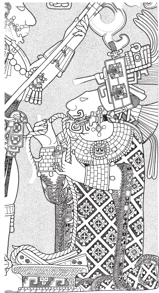
Figure 3. Late Classic bloodletting scene, Yaxchilan Lintel 24; detail of cord with possible acacia thorns at right (left, Graham and von Euw 1971:53; right, detail by author).

Since last century, it has been noted that Acacia cornigera and related species of thorny acacia serve as hosts for small but