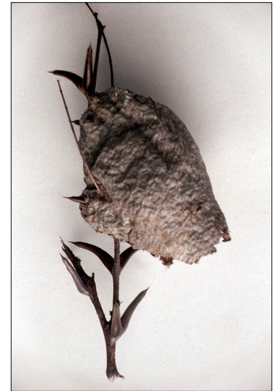
Figure 4. Hornet nest in dry branch of bull’s horn acacia, collected by author in vicinity of Chichen Itza, Yucatan, June 1985.